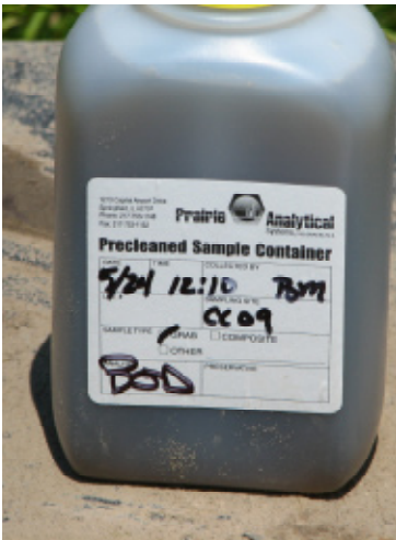
Stream water polluted by manure

In 2012 and beyond, we will continue to address the most important issues for the health of our rivers and the health of our communities. Our goals include: