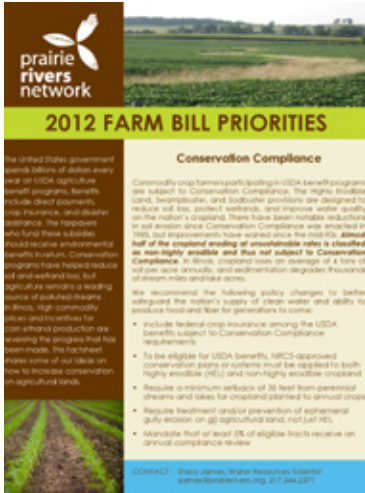
PRN fact sheet on 2012 Farm Bill

We will continue to press for increased oversight of under-regulated factory farms and strengthened state livestock regulations.