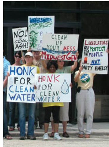
Joliet rally against coal waste pollution

Without our actions, state regulators lack the backing they need to be tough on pollution. Our efforts will compel regulators to establish limits for nutrient pollution that fouls state waters and causes the Gulf of Mexico's Dead Zone. Winning better controls on coal ash disposal will protect communities from groundwater pollution. We will continue to work directly with industry to demonstrate and document cost-effective methods for reducing water pollution.