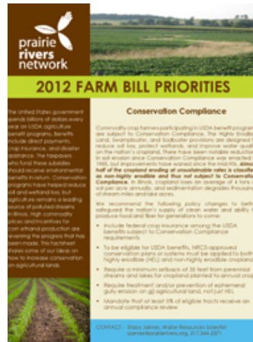
PRN fact sheet on 2012 Farm Bill

We will continue to press for increased oversight of under-regulated factory farms and strengthened state livestock regulations.