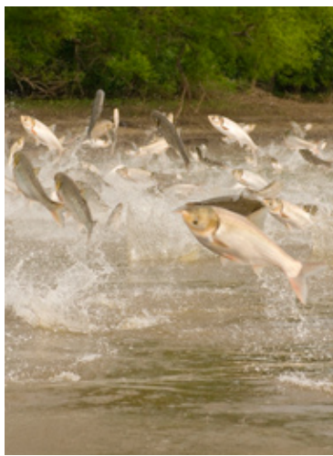
Asian carp on Illinois River

There is great need to change the way we live with our rivers. The manmade reversal of the Chicago River and the levees and dams that choke the Upper Mississippi River have outlived their purpose. The current practice of paving and plowing to the edges of rivers and wetlands results in increased flooding and pollution. Our work to prevent the spread of Asian carp and other invaders, and to improve river-side habitat conservation will promote a new paradigm of mutual benefit, fostering a healthier living and working relationship with our rivers.