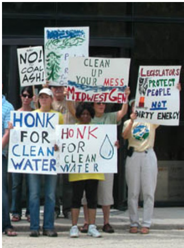
Joliet rally against coal waste pollution

Without our actions, state regulators lack the backing they need to be tough on pollution. Our efforts will compel regulators to establish limits for nutrient pollution that fouls state waters and causes the Gulf of Mexico's Dead Zone. Winning better controls on coal ash disposal will protect communities from groundwater pollution. We will continue to work directly with industry to demonstrate and document cost-effective methods for reducing water pollution.