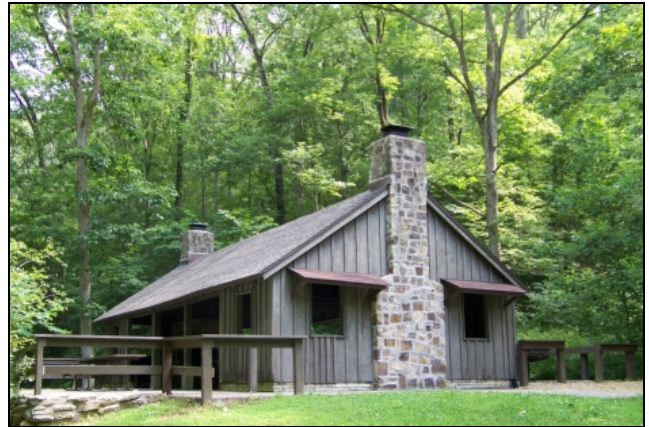
Trail of Tears State Forest Facility

riding, hunting, picnicking and camping are allowed within the park but hunting, horses and cars are not allowed in the nature preserve.