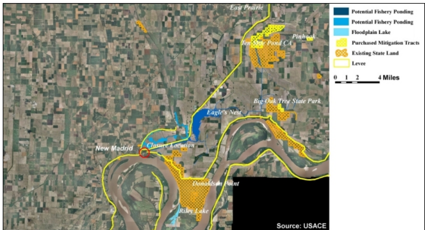
New Madrid Floodway Levee Closure – red circle area

Not so coincidentally there is a lawsuit working its way through the federal courts on this project, in which the plaintiffs assert that the project violates several major environmental laws including the Clean Water Act and the National Environmental Policy Act. If the appropriations bill that contains the rider is approved by Congress the lawsuit would be moot and the project would no longer be subject to our environmental laws. We do not believe that this was the intent of law-makers who drafted these acts.