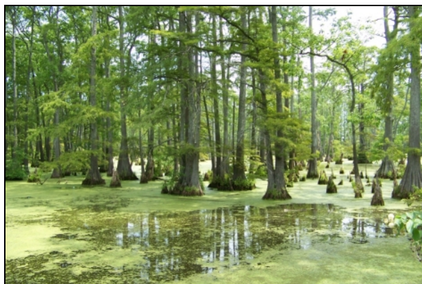
Horseshoe Lake Conservation Area

Later that day I took a tour of Horseshoe Lake Conservation Area, which is just south of Olive Branch and northwest of Cairo off of Illinois Route 3 in Alexander County. The contrast between the flat Horseshoe Lake Conservation Area and the hilly Trails of Tears State Park is stark and it is hard to believe that they are only about 30 miles apart.