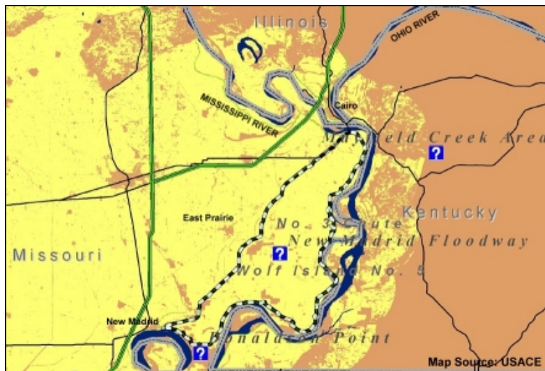
New Madrid Floodway – inside black/white line

The local Congresswoman promoting the project likes to call those who oppose the project environmental