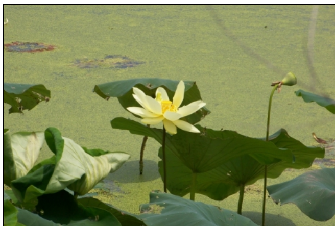
Horseshoe Lake Conservation Area – Water Lilly

When you drive into the 10,200-acre area you feel like you have been transported to a bayou in Louisiana with Lilly Pad covered water and cypress, tupelo and wild lotus trees. The 2,400-acre lake is actually an oxbow lake created from a separated meander of the Mississippi River, more apparent when one looks at it on a topographical map [See map below] or aerial photo.