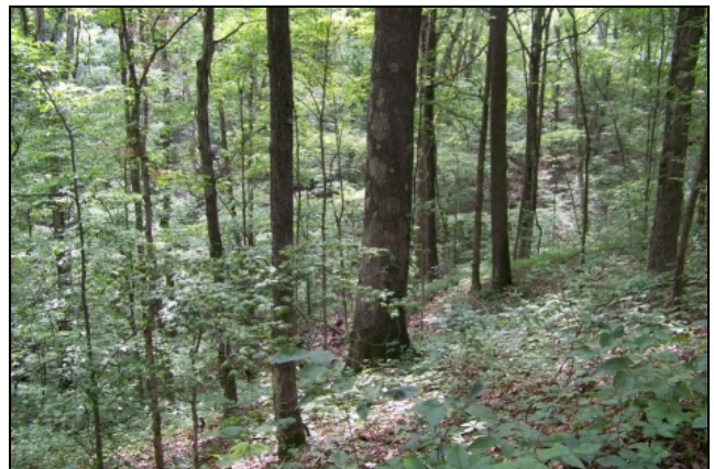
Trail of Tears State Forest Southern Area

It is the rugged, hilly forest that attracted me to this park, which contains a diverse variety of hardwoods, shrubs, wildflowers, birds, mammals and a couple of species of rattlesnake.