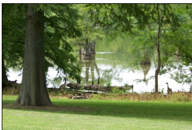
Horseshoe Lake Conservation Area - Geese