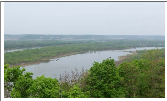
Stump Lake from Pere Marquette State Park

Stump Lake (Completed) – This project covered a large 2,958 acre area of various habitats: 1,221 acres of open wetlands, 1,485 acres of forest and 252 acres of cropland.