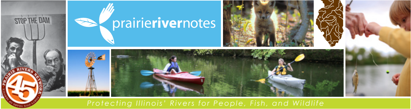
Protecting Illinois' Rivers for People, Fish, and Wildlife