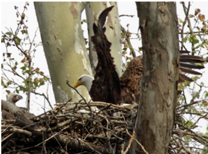
Preparing for take-off