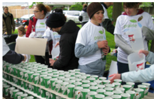
PRN staff, members, and friends volunteered to hand out water at mile 23