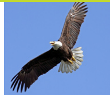
Soaring over the Middle Fork

led to state—and later federal—protections that are allowing 11,000 acres of wildlife habitat to recover along 17 miles of river. Now we can watch the eagle populations grow—2 chicks last year and 3 this year.