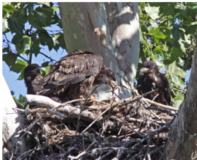
Lunch time for hungry eaglets

Thanks to its status as our national emblem—a symbol of freedom—the bald eagle inspired thousands of people to ensure its survival. Every day at Prairie Rivers Network, we advocate for policies to protect the healthy stream corridors needed by hundreds of other species that lack such charisma. As we take a moment to celebrate this story, we also take this opportunity to thank all our volunteers and donors for making these successes possible.