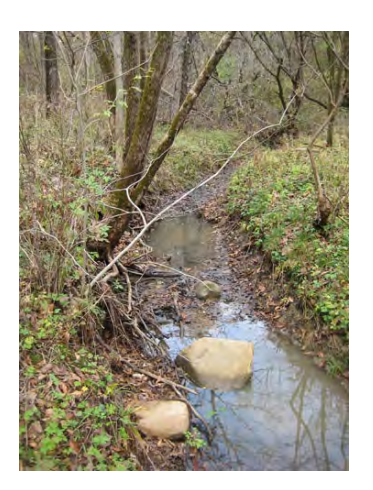
The coal mine would have polluted beautiful Copperas Creek.

There is no doubt that the North Canton permit should have received more scrutiny from the very beginning. Instead, Canton residents had to wage an eight-year battle to prove to the state that coal mines don't belong next to drinking water supplies.