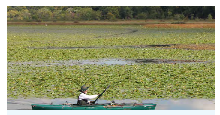
Our vision for a healthy Illinois River includes valuable backwater wetlands for recreation, habitat, and water quality.

We initiated the Middle Illinois River Conservation Partnership to restore and connect habitat along the River, pursuing a vision for a healthy Illinois River system that supports people and wildlife.