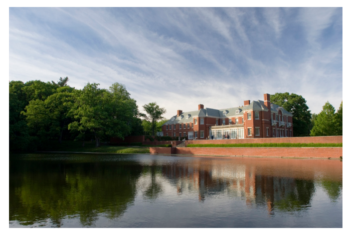
Our founders' efforts ensured that the Sangamon River and Allerton Park were preserved for future generations to enjoy. We proudly carry on their legacy today.

As our Golden Anniversary year (2017) fast approaches, we are taking stock. We are reflecting with pride on our founding accomplishments - saving one of Illinois' great rivers, a beloved park and natural area, and some of the richest farmland in the world from the destructive ravages of a dam.