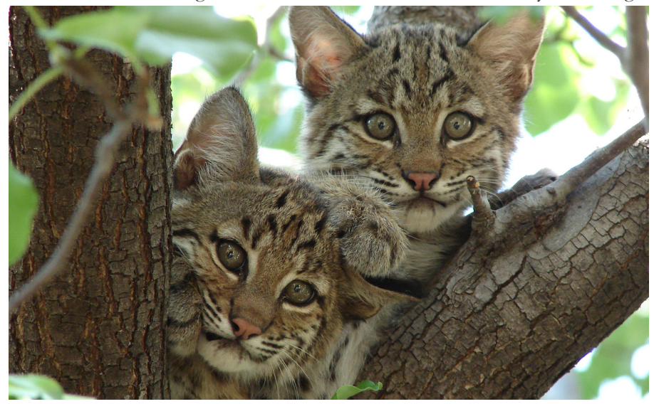
Bobcats were nearly eliminated from Illinois but have made a remarkable recovery.

Waiting until a species, such as the iconic monarch butterfly, is in danger