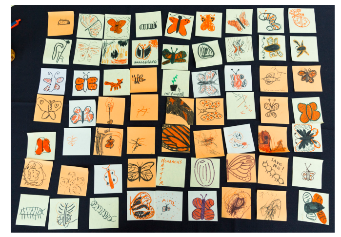
At a recent celebration of monarchs, kids showed their support for pollinators by creating a paper quilt.

In April, an ambitious group of Urbana youth, ages 4-10, took on the Illinois Marathon 5K challenge as a PRN team. Not only did they run the 5K, together they raised over $1,000 for us! In May that same group joined me in calling on Urbana Mayor Laurel Prussing to take the Mayor's Monarch Pledge. We visited with the Mayor in Council chambers, and each member of the little group asked the Mayor if she could take one action in the Monarch Pledge. And then the two youngest members of the group (both aged 4) shouted out, "Plant milkweed, please!"