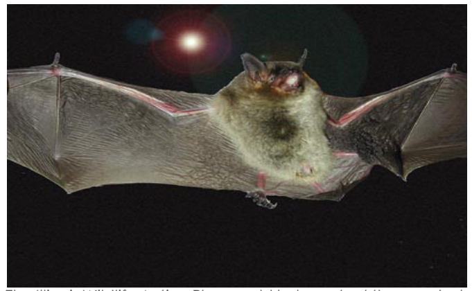
The Illinois Wildlife Action Plan would help protect the gray bat.

Millions in new funding for Illinois' Wildlife Action Plan would expand protections for 36 species of special concern, including 23 endangered, 8 threatened, and 5 watch-list species such as the prairie-chicken, barn owl, short-eared owl, northern harrier, upland sandpiper, Eryngium stem borer, king rail, least and American bittern, loggerhead shrike, ornate box turtle, and monarch butterfly. Implementing actions in the plan will make a difference for these and other species that are threatened by climate change, development, and intensive agriculture.